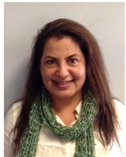
Chief Executive Officer

Acknowledgement is given to the AbSec Board for their ongoing support and leadership.