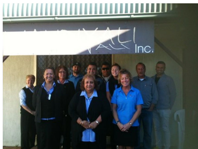
Above: Wandiyali staff